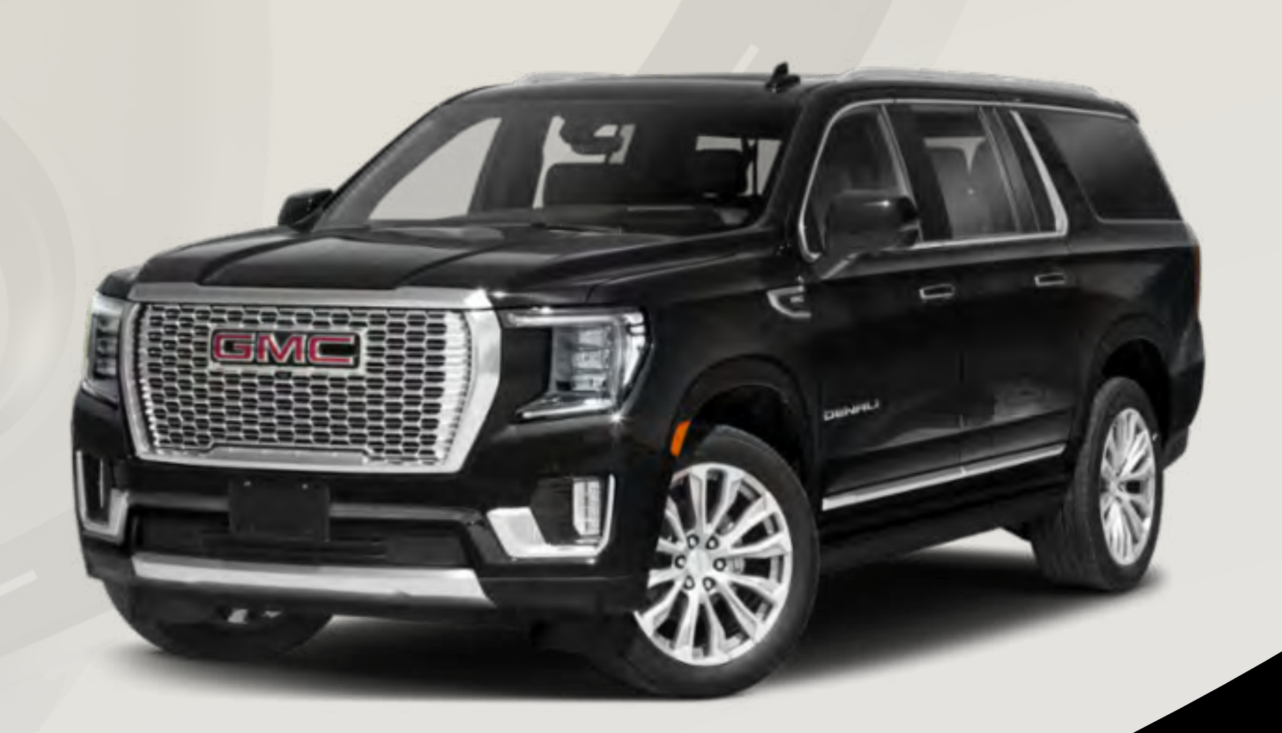
GMC Denali Yukon