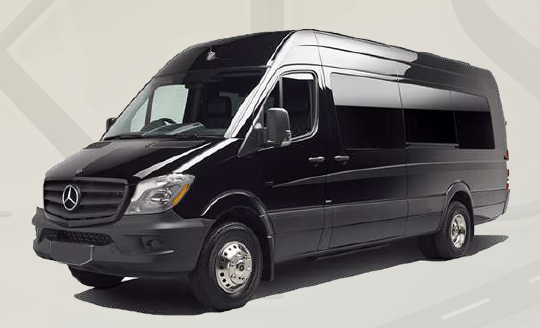
Mercedes Sprinter Passenger